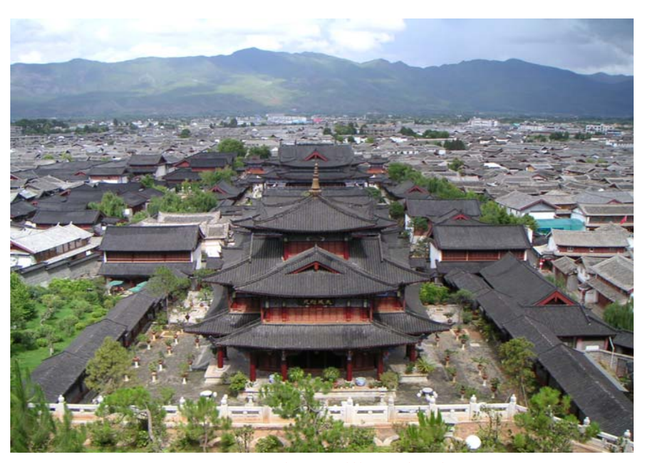
The Earthly Paradise—Lijiang Ancient Town

August 7-11, 2011 Lijiang, Yunnan, China